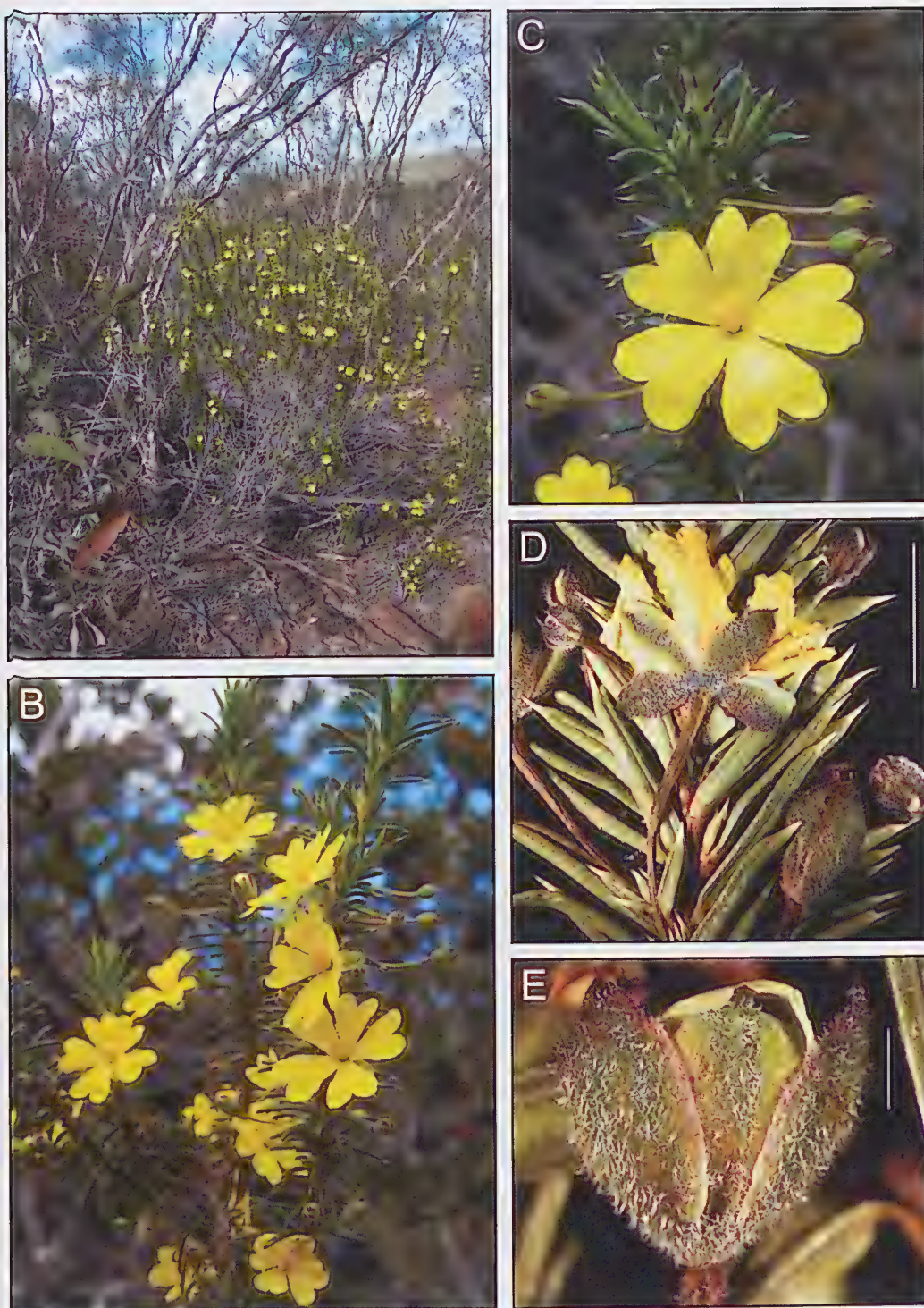
Figure 1. Hibbertia abyssa (A. Markey & J. Allen 6216). A – habit; B – stem portion showing ascending young leaves, spreading mature leaves and axillary flowers on long peduncles; C – flower, with stamens arranged on one side of the carpels; D – portion of herbarium specimen showing the pungent leaves and long \pm glabrous peduncles, scale 5 mm; E – bud, showing the uncinata-hairy sepals, scale 1 mm.